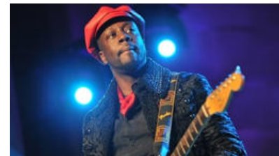
Wyclef Jean Kicks Off a Dance-Off at the Refugee Gala