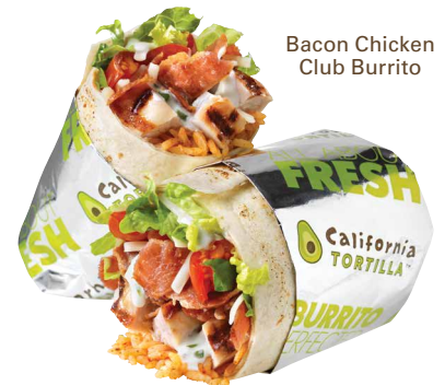
Bacon Chicken Club Burrito