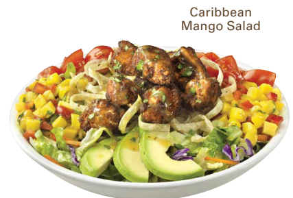
Caribbean Mango Salad